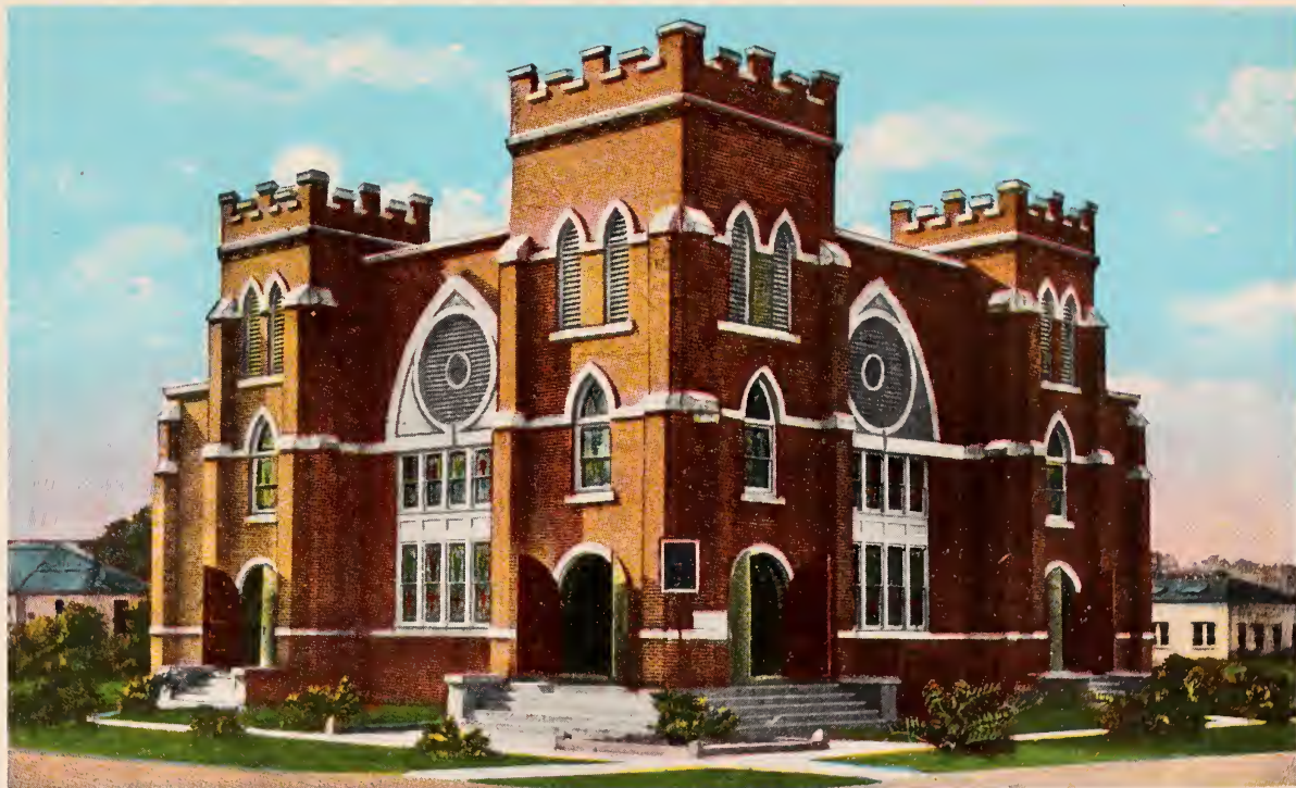
K-25—First Baptist Church, Kissimmee, Fla.